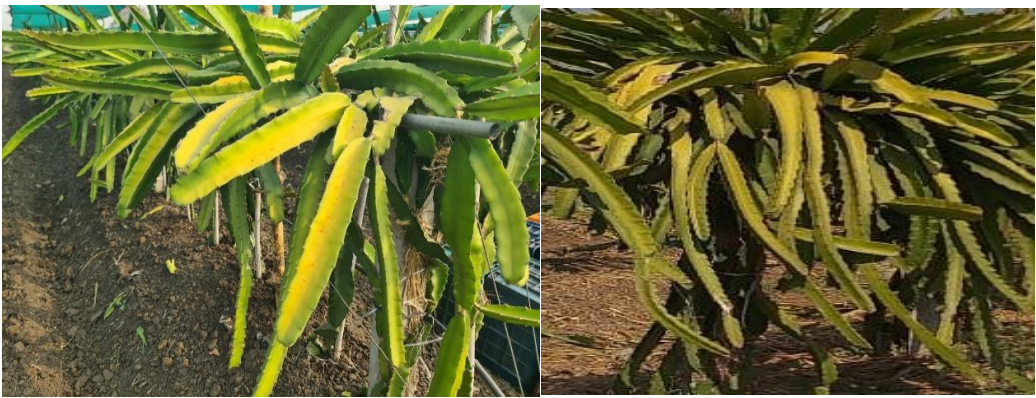
Disease management practices in visited dragon fruit farms.

Although dragon fruit is heat loving, it can be damaged by long periods of intense sun and heat. Growth and sun burning injuries closely related to heat stress experienced by the several (80–95%) dragon fruit farmers. It occurred particularly during summer season. The symptom appeared during the month of March and April that witness higher variation in day and night temperatures in regions crosses above 38°C (Arivalagan et al., 2019). The intensity of sun burning on plant leaves and stem varies between 10–50%. The dragon fruit plants which facing to direct sun rays causing sunburns while those growing in low light intensity are without sunburns.