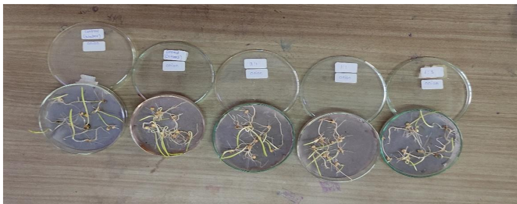
Photograph showing effect of onion peel extract on Jowar seedlings