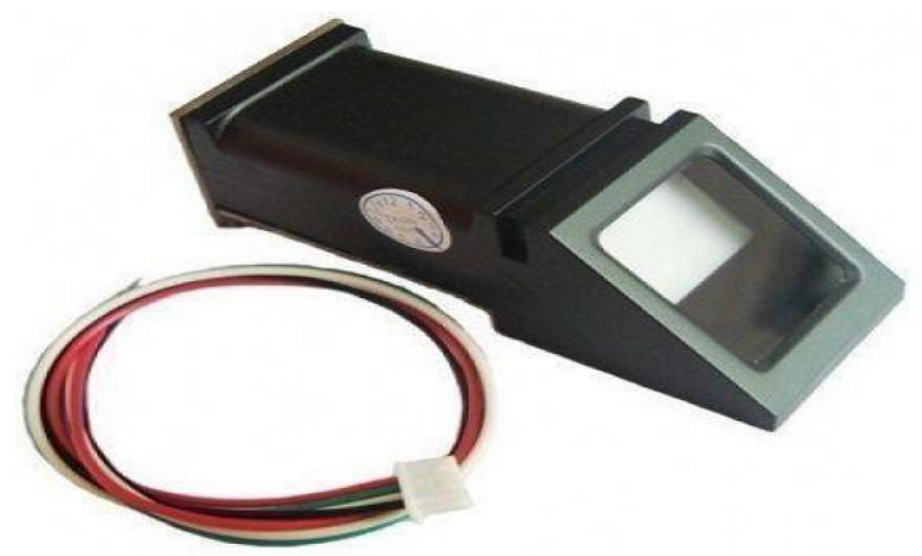
Fig 4.2: Fingerprint sensor

A fingerprint sensor is an electronic device used to capture a digital image of the fingerprint pattern. The captured image is called a live scan. This live scan is digitally processed to create a biometric template which is stored and used for matching. Optical fingerprint imaging involves capturing digital image of the print using visible light. This type of sensor is, in essence, a specialized camera. The top layer of the sensor, where the finger is placed, is known as the touch surface. Beneath this layer is a light-emitting phosphor layer which illuminates the surface of the finger. The light reflected from the finger passes through the phosphor layer to an array of solid- state pixels which captures a visual image of the fingerprint. A scratched or dirty touch surface can cause a bad image of the fingerprint. A disadvantage of this type of sensor is the fact that the imaging capabilities are affected by the quality of skin on the finger. For instance, a dirty or marked finger is difficult to image properly.