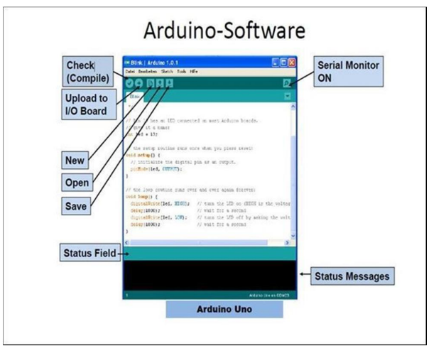
Fig 6.1: Arduino Software