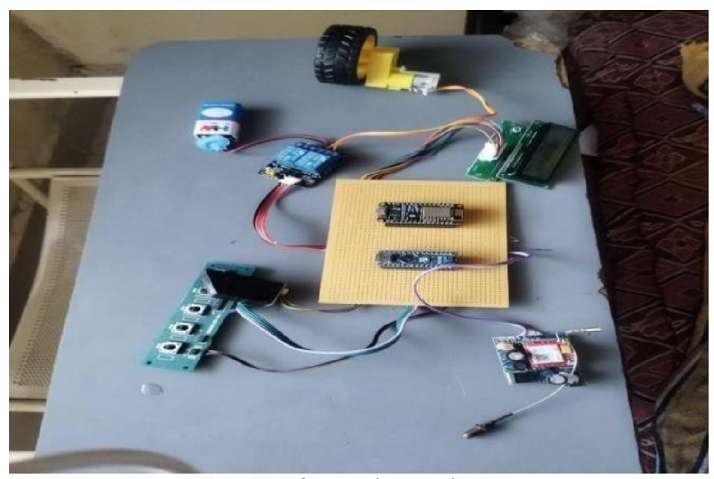
Fig 7.1: Before Implementation