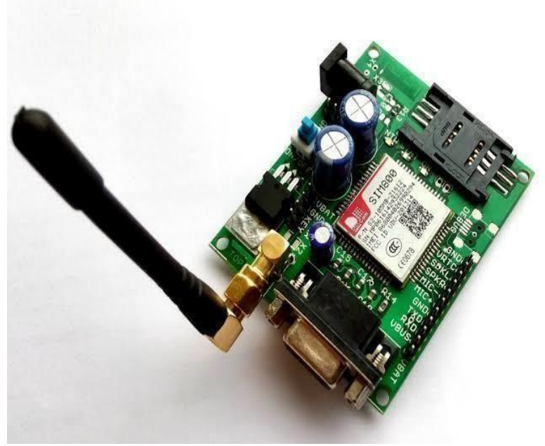
Fig 5.1: GSM Module

It can be used to make calls; send text messages and emails in case it is an Internet based SIM card. The GSM Module uses a dual band 900/1800 MHz GSM modem. It works on 4 V DC regulated power supply that is controlled by the microcontroller. Apart from that it is a plug and play device which means no drivers are required for this module to be installed. The purpose for this Hardware's usage is to send a message to the registered mobile number, when someone tries to access the vehicle illegally.