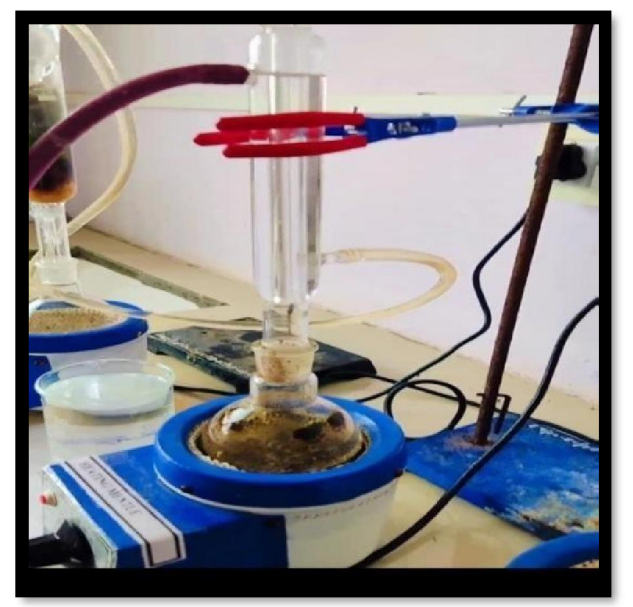
Figure: Plant extraction

Iyengar yoga focuses on holding poses and using props (blocks, belts, chairs, and blankets) to suit different physical capacities. Other yoga types exist, and the experience in one style or class might be extremely different from the experience in another. The Yoga can range in intensity from light to severe, with some styles focusing on a cardiovascular workout and others on relaxation and peace. Another sensory element is the yoga facility itself, which can foster a sense of social and spiritual connection. Yoga's popularity has skyrocketed during the last few years. The Centres for Disease Control and Prevention's (CDC) National Health Interview Survey results suggest a growth in the use of complementary and alternative medicine (CAM) treatments [19]. Yoga was the seventh most popular complementary and alternative medicine therapy in 2007. CAM therapies are most commonly utilised to treat musculoskeletal problems, such as back pain and, to a lesser extent, neck discomfort.