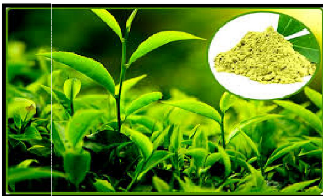
Figure: Green Tea

7) Green Tea: Herb tea It is beneficial for healthy hair due to the presence of vitamin B (panthenol), epigallocatechin gallate (EGCG), vitamin C, theanine and anti-oxidants-