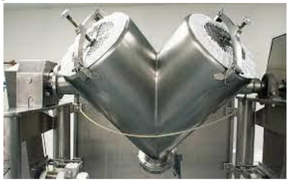
Figure 5: Spray Dryer

Takes a liquid sluice and separates the solute or suspense as a solid and the detergent into a vapor. The solid is generally collected in a barrel or cyclone. The liquid input sluice is scattered through a snoot into a hot vapor sluice and wracked. Solids form as humidity snappily leaves the drop, product of dry flavouring's is achieved fluently with spray drying. The Spray Drying process involves a waterless feed material which includes water, carrier, and the flavour is comminated into a sluice of hot air. The atomized papers tend to dry fleetly. The unpredictable flavour ingredients are trapped inside the driblets. The greasepaint is occasionally recovered via cyclone collectors. Since spray drying fashion is inversely good in running of both water answerable and oil painting-answerable flavour systems, it continues to be the preferred encapsulation process. It is also fairly brought effective and can be fluently gauged from airman factory to the marketable product. [figure 5]