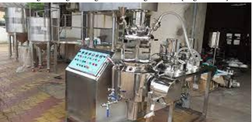
Figure 7: Homogenizer

Beauty and soft skin and fragrance aside, homogenizers are used for an array of purposes. They reduce particle size by forcing liquid through a narrow tube at high pressure; the resulting product can be used to create anything from tasty beverages to cancer treatments homogenizer machines are pieces of equipment used for the homogenization of various types of material. High-pressure homogenization in the pharmaceutical industry has proven its ability to make more stable products, with better API dispersion. The homogenizer principle of operation is a rather simple one: spread the laser energy, typically concentrated at the center of the beam, by scattering the beam so that it overlaps itself multiple times, creating a beam with a larger divergence angle than the original beam [Figure No 7]