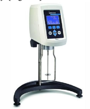
Figure 2: Brookfield Viscosity

body(spindle) is immersed in the oil painting and rotated at a defined speed. The force needed to keep this speed constant is a dimension for the dynamic density. [Figure 2]