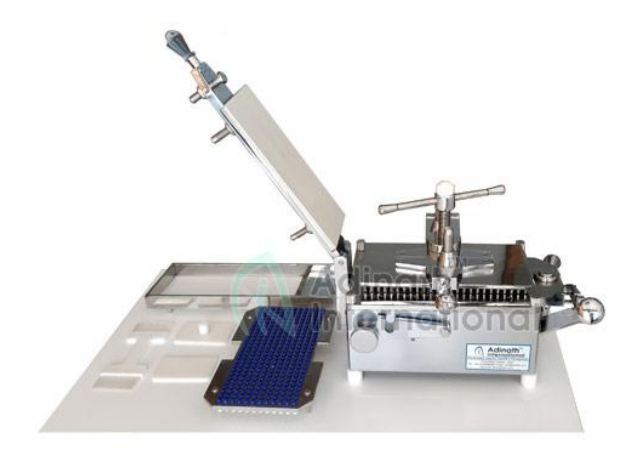
Figure 4: Capsule Filling Machine