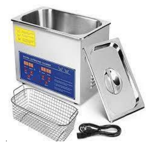
Figure 8: Ultrasonic