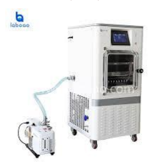
Figure 6: Freeze Dryer