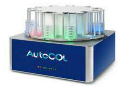
Figure 9: Colony Counting

The purpose of colony counting is ultimately to estimate the number of cells present based on their given ability to continue to grow and expand under certain conditions. The colony counters can use fluorescent labels or contrast between light. [Figure No 9]