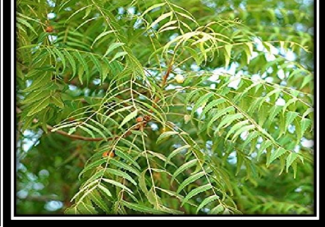
Figure: Mimosa pudica L.