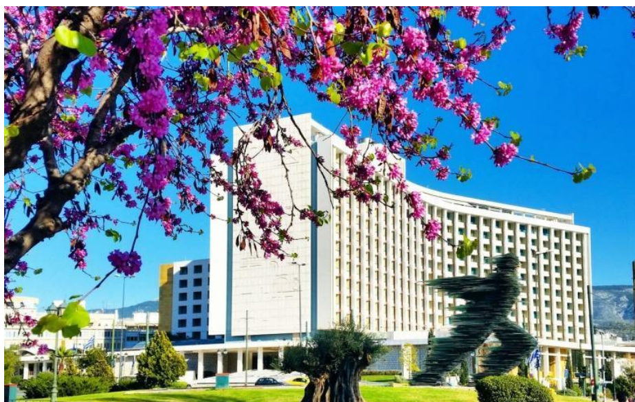
CONRAD HOTEL, ATHENS

It will put Athens on a different high-income client map, creating a whole new dynamic. International hotel brands are already rushing to take a position in the market of tomorrow that is being created right now, because they are counting on the brand strength of the very complex destination that is Athens.