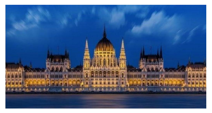
Hungary Business Hub