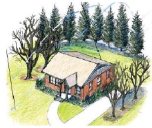
Figure 2: Surrounding vegetation to pre-cool winds & manage moisture percentage (2016)

The role of vegetation in reducing solar heat is critical. It has been shown that changing the surrounding atmosphere and decreasing irradiance achieved by vegetations is an efficient way of minimizing energy consumption for space cooling, and that approximately 25-80 percent savings on air conditioning can be achieved with correctly & escaping.