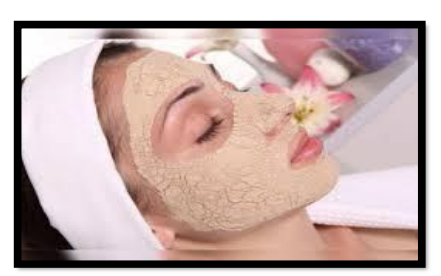
Fig 10 Application of face pack on skin