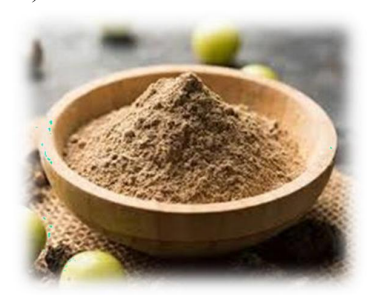
Figure 1: Amla

Chemical constituents: The fruit of Amla is rich in vitamin C (ascorbic acid) and contains several bioactive phytochemicals, of which majority are of polyphenols(ellagic acid, chebulinic acid, gallic acid, chebulagic acid, apeigenin, quercetin, corilagin, leutolin, etc.)