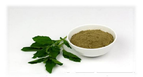
Figure 5: Tulsi