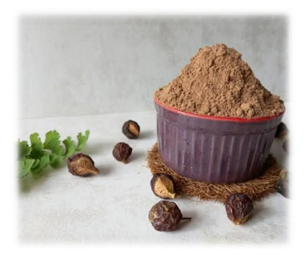
Figure 3: Reetha

Synonym : Soapnut , Sapindus mukorossi , Haithaguti , Ritha, Aritha, Dodan, Kanmar, Rithe, Thali, Phenila , Urista, Kunkudu, Krishvarn, Arthsaadhan , Rakhtbeej, Peetfan, Phenil, Garbpatan, Guchfaal, Areetha, Ita, Kunkute kayi, Ponnan kottai, Rithegach, Rittha, Dodan, Soapnut tree, Chinese soapberry.