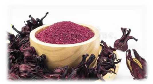
Figure 2: Hibiscus

Synonym: shoeblack plant mahagua ,mahoe, cotton rose ,roselle.