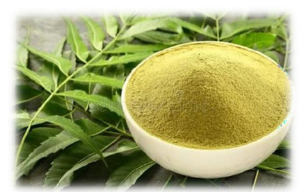
Figure 4: Neem

Synonym: Neem tree; nim tree; margosa; arishth; Azadirachta indica; Melia Azadirachta; tree.