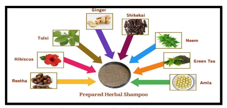
Figure 9: Prepared Herbal Shampoo