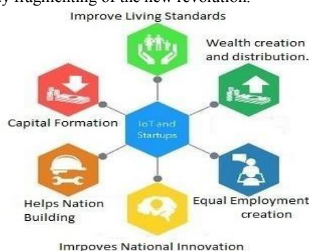
Fig 1: Scope of IoT

In the upcoming years, IoT will have wide and major changes in business models, trade standards , security, and , infrastructure during the complete IT computing and networking systems . The Internet of Things is a new glow of technology advancement in the premature stages of market development. IoT has the possibility to speed up “sharing economizing.” So as to suggest new approaches to managing and tracking minor things, it will also authorize the sharing of new, minor and economical entities outside the communities, planes, motorcars, and motorbikes. As it trends go on, it will contribute exclusively untried applications, that willpower drives new company prototypes and profit prospects. It makes devices and sensors to more powdery levels and helps the invention of new uses, new applications, new services, and new business prototypes that were not previously economically feasible. It will also be risky for lots of current industries. Today, worldwide IoT Technology is among the leading 5 technologies according to Gartner’s Chart. That implies It is highly utilized in different sectors in the additional role whether it is in clever homes or vehicle tracking, kids and old age people observing or daily routine job. However, at present, the fact is that these features engage several IoT helping devices, and the future is already fragmenting of the new revolution.