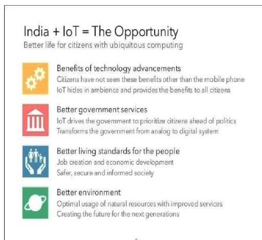
Fig 2: Future of IoT in India

Although according to Indians necessities, IoT consequences are useful in each domain and various businesses sponsor in lots of sectors and this percentage is boosting day by day[2], concentrate on Smart Water Management, Smart Waste Management, Healthcare, Smart Agriculture, Smart Environment, Smart Safety, Smart Supply Chain, etc. but according to the Indian thrift factor affordability to a billion population is very challenging. Supporting the circumstances and Indian Infrastructure like power supply, poor pollution, extreme temperatures, high levels of humidity and dust, No clean and insufficient telecom range.