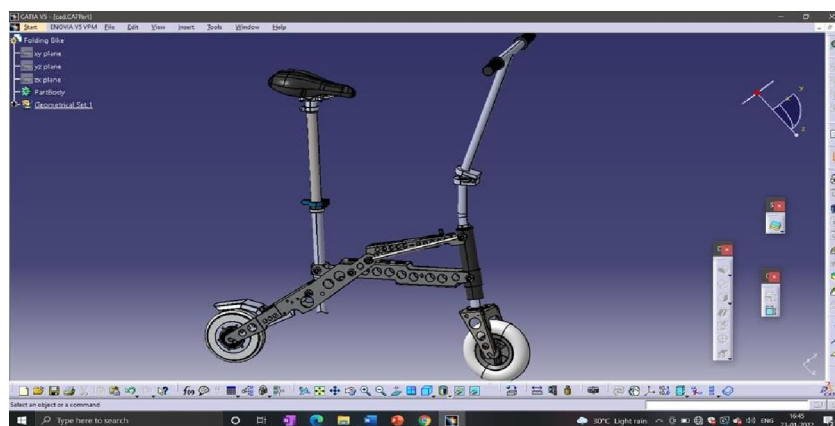
Figure 2. Isometric View