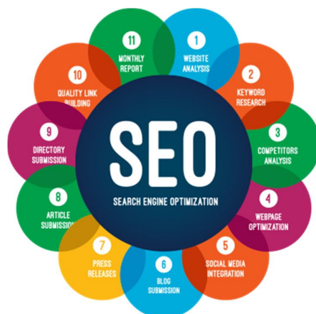
Fig. 1 Search Engine Optimization

Links provide various ways to connect our website and brings the traffic towards our website. keywords play an important role in the SEO. Proper keywords are the best match for best ranking. optimized website is always best for high ranking and high traffic.