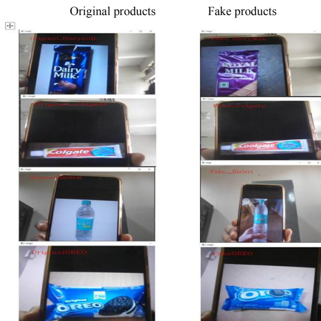
Figure 2: Detect original and fake products

In the figure 2, left side column represent the original products and right side column represent the fake products of images. Classify this result by using train and test the different images of dataset.