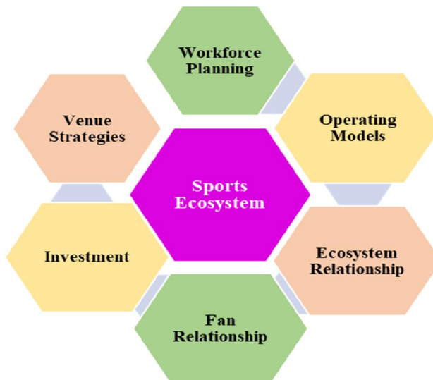
Figure 2: Various aspects of Sports Ecosystem

Power dynamics in traditional sports structures can exacerbate human rights risks to athletes and others. Rethinking sports from a human-centered perspective is an important way to address this concern. Through the human rights lens in the sports environment, a forum representing a complex web of symbiotic relationships is created that engages those involved and between different groups of institutional players. The ecosystem model, which focuses on human rights within the institution, demonstrates that each of these interactions between all stakeholder groups can have a positive or negative impact - different individuals and communities, through the direct and indirect role they play (26).