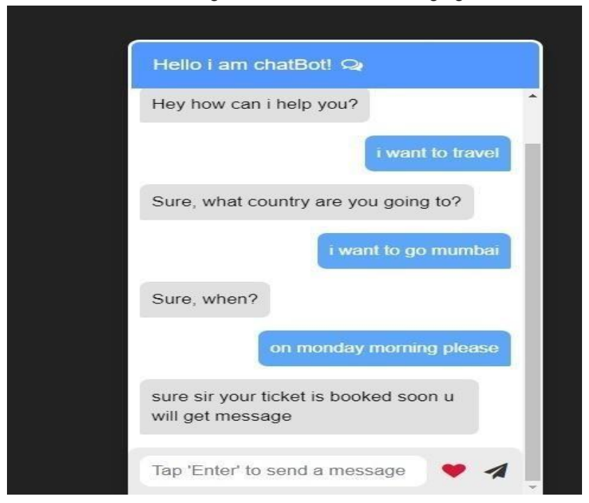
Fig. 1 SNAPSHOT 1