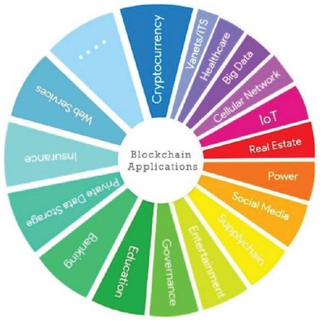
Figure 3: Application of Blockchain

Beyond the currency setting, there are other uses for blockchain too. Its underlying technology is used in various applications. Figure 3 shows the various applications of blockchain. Some of the applications of blockchain is listed below.