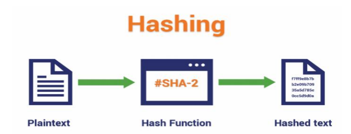
Figure 7: Hash Function