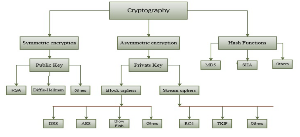
Figure 3: Diagram of Categorization of Different Cryptographic Techniques.