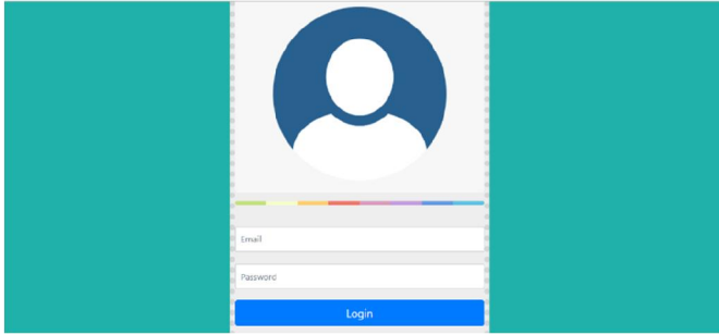
Fig. 1. Login Page

Figure 2 depicts the user's login page, where he must provide a username and password before clicking the login button to access the online pharmacy system. Then he can purchase whatever he requires. However, if the consumer correctly enters his or her account information, he or she will be allowed to use the system. The system will have prohibited the user if the customer entered an invalid account three times.