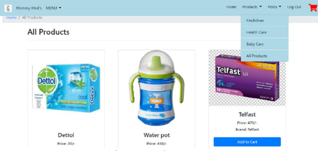
Fig. 5. Products Page

Figure 5 depicts the pharmacy, baby care, and health page, which contains many different medicines that people require in their daily lives when they are sick or have other needs, as well as information about the commodity and price, such as medicines (medicines for colds and chest diseases, fever and some ointments for allergies, dermatitis and some cosmetics and hair care and skin, and many others). This page also has a search icon that allows the user to quickly search for the type of medication that the client need, and the system will immediately display the drug that the customer requires.