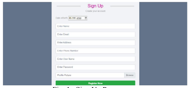
Fig. 1. Sign Up Page

The registration page is shown in Figure 1. It is used to create a new account for new clients. The customer should complete all fields, including full name and phone number, address, username, password, and email address. The customer should remember his or her username and password because they will be used to log into Mommy Meds. After the customer has completed all fields, click the complete registration button.