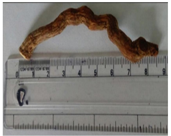
Fig. 2. Root of Rauwolfia serpentina

It is an erect evergreen perennial bush with along irregular, yellowish root stalk to a length of 60 -90 cm the fruits are drupe 0.5 cm in measurement and sparkling dark when completely ready. The plant is found in tropical Himalayas in lower hills himachal Pradesh.