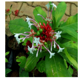
Fig. 1. Plant of Rauwolfia serpentina

India has the diverse, oldest and richest cultural tradition associated with the medicinal. plants for curing numerous diseases. Plant-based treatments are safe, accessible, economic, reliable, and effective. Rauwolfia serpentine is the dried root of rauwolfia serpentine (linne) bentham ex kurz.( family: Apocynaceae). It is an erect shrub that grows 1 meter in the height and has cylindric stems. These stem have pale bark and consist of light colored viscous latex. <sup>[1][2]</sup>