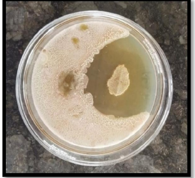
Fig. 4: Antibacterial Assay