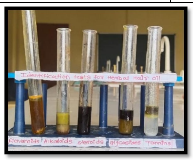
Fig .6: Phytochemical Screening DOI: 10.48175/IJARSCT-4808