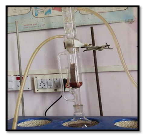
Fig 1: Extraction of Hibiscus by Soxhlet Extraction