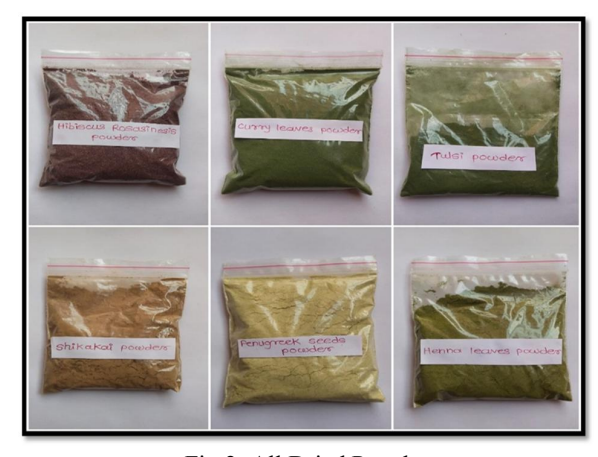
Fig 2: All Dried Powder

Filter the mixture by muslin cloth & make up the valume with coconut oil.