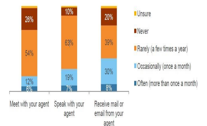
How often do you interact with your agent in the following ways?

Although the Internet is becoming a popular method of purchasing auto insurance, many consumers still choose to purchase offline. Even consumers who feel comfortable quoting offline still purchase through offline modes, with 80% of respondents who shopped offline stating they then went offline to purchase. Of those who purchase offline after shopping offline, 62% end up purchasing in person through a local agent and an additional 31% purchase with a local agent over the phone.