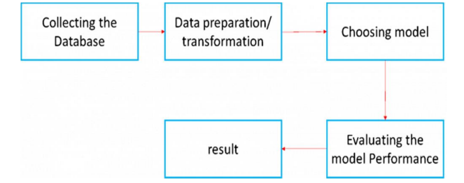
Fig. 1 Methodology Block Diagram

COVID-19 positive cases detection is performed using convolutional neural networks. In particular, we used well known deep CNN models for classification of images which have are pre-trained from large image databases and retrained them to learn COVID-19 positive vs negative cases. Chest Xray images which have been clinically diagnosed as COVID- 19 positive are preprocessed and afterwards are used to retrain existing deep CNN models for image classification. X-ray images preprocessing consists of image resizing and pixel values normalization to meet the input specifications of each pretrained deep CNN model. The CNN models are retrained as binary classifiers to identify positive COVID-19 against non-COVID-19 chest X-ray images. The retrained deep CNN models and used for testing, receiving as input new chest X-rays with unknown clinical diagnosis in order to automatically label them as positive COVID-19 cases or not, i.e. providing a binary decision per chest scan. The block diagram of the evaluated architecture for detection of COVID-19 positive cases from chest X-ray images is illustrated in Fig 1.