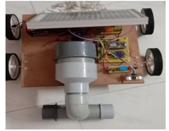
Figure 4.2: Solar Floor Cleaner Robot

Figure illustrates a simplified flowchart of the working of the robot. When the bot is switched on the suction and mopping mechanism turns on, then ultrasonic sensor checks for the presence of any head-on obstacles. In case of any head-on obstacles it takes a clockwise or an anti-clockwise turn, in case of absence of obstacles, it checks for any impact on the bumpers. If any impact is detected, the robot moves away from the impacted object and in absence of impact it moves forward and checks for any head-on obstacles and the loop continues.