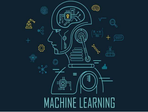
Fig -1: Machine learning outlook

• Supervised learning: The computer is presented with example inputs and their desired outputs, given by a "teacher", and the goal is to learn a general rule that maps inputs to outputs.