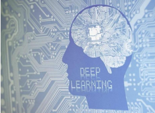
Fig 3: Deep learning

Deep learning methods aim at learning feature hierarchieswith features from higher levels of the hierarchy formed by the composition of lower level features. Automatically learning features at multiple levels of abstraction allow a system to learn complex functions mapping the input to theoutput directly from data, without depending completely onhuman-crafted features. Deep learning algorithms seek to exploit the unknown structure in the input distribution in order to discover good representations, often at multiple levels, with higher-level learned features defined in terms of lower-level features.