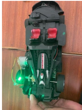
Fig. Experimental Setup

The electric motor converts electrical energy from the battery into torque, which is then supplied to the driving wheel to propel the vehicle forward.