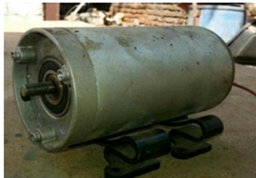
Figure 2: Dynamo

Dynamo is an electrical generator. This dynamo produces direct current with the use of a commutator. Dynamos were the first generator capable of the power industries. The dynamo uses rotating coils of wire and magnetic fields to convert mechanical rotation into a pulsing direct electric current. A dynamo machine consists of a stationary structure, called the stator, which provides a constant magnetic field, and a set of rotating windings called the armature which turn within that field. On small machines the constant magnetic field may be provided by one or more permanent magnets; larger machines have the constant magnetic field provided by one or more electromagnets, which are usually called field coils. The dynamo used for this analysis is RS-775, which has a maximum output voltage of 12 V [4].