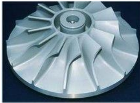
Figure 1: Turbine