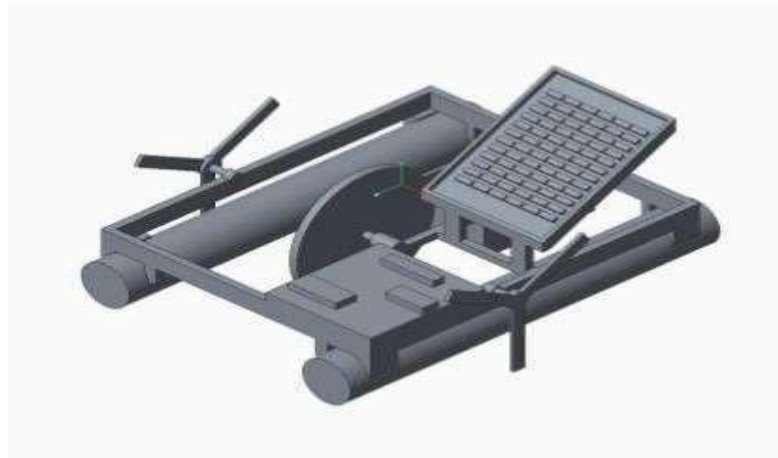
Fig 1: Construction of Sea Oil Separator

Two dc motors are connected to two propellers. When propeller rotate in clockwise direction oil skimmer moves in right direction. When propeller moves in anticlockwise direction oil skimmer moves in left direction. Rotation of the propeller is controlled by dc motors. Third dc motor is connected to rod of the skimmer disc. Rotating Disc of Acrylic material attracts oil which is dumped into collecting tank. Skimmer is partially dipped in water for more contact. Disc is floating and rubber scraper is attached to the disc it collects oil in storage container.