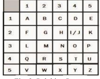
Fig. 2: Polybius Square