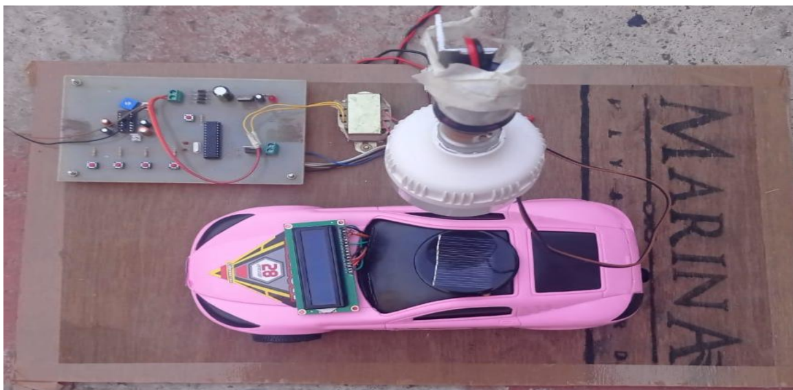
Figure 2: Practical setup of Li-Fi Audio and Data Transmission Via Light

The leds can be switched on and off very quickly, which gives nice opportunities for transmitting data. hence all that is required is some leds and a controller that code data into those leds. all one has to do is to vary the rate at which the led's flicker depending upon the data we want to encode. further enhancements can be made in this method, like using an array of leds for parallel data transmission, or using mixtures of red, green and blue leds to alter the light's frequency with each frequency encoding a different data channel.