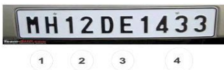
Figure 1 Number Plate

A typical example of an Indian license plate for car is shown in the figure 1 with the significance of each character (1. State Code, 2. District Code, 3.Type of Vehicle (car, two wheeler, commercial etc.) 4. Actual Registration Number )