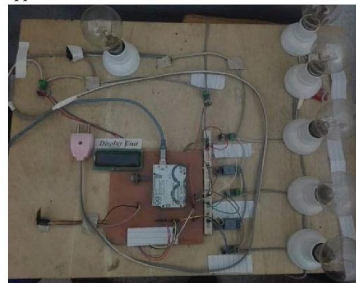
Fig. 3: Hardware prototype of IoT based power monitoring system.

monitoring system is shown in Fig. 3. The loads are connected to this hardware setup to evaluate its performance. For local display, LCD is used to show the real-time results of the load, and the WiFi module communicates load data to ThingSpeak application.