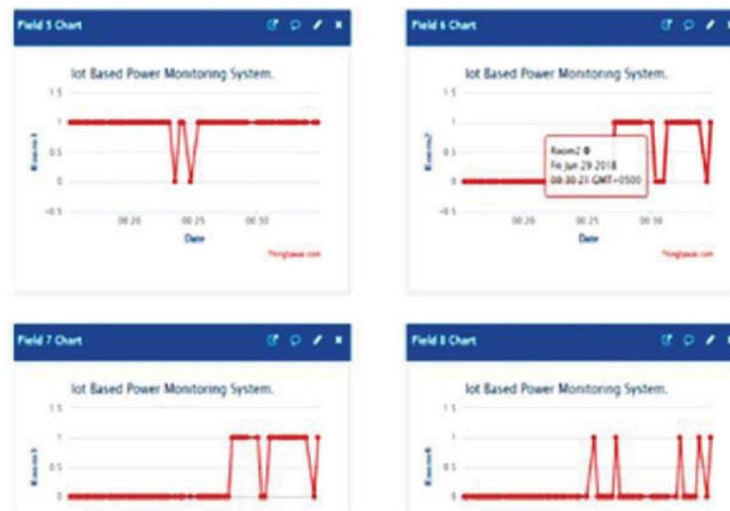
Fig. 5: Load status at different periods.

The electrical measurements (voltage, current, power, and energy consumption) of the load is depicted in Fig. 4. It shows electrical parameter information at different instants. The consumer can visual load information at any time (hourly, weekly, or monthly).