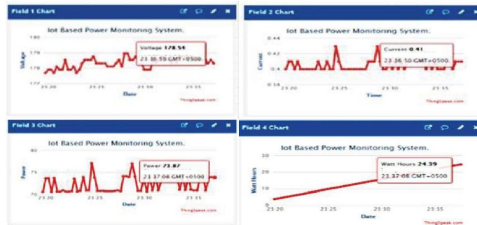
Fig. 4: Electrical measurements (voltage, current, power, and energy consumption) of load.