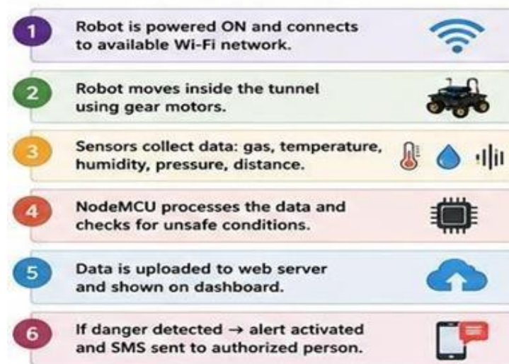
Figure: Working steps

The proposed system operates using continuous environmental sensing, real-time processing, and wireless communication, similar to existing IoT-based industrial monitoring frameworks [19], [21].