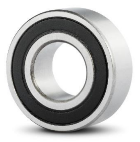
Figure 6: Bearing.

Bearings reduce friction between moving parts by restricting relative motion to only the desired motion. The bearing may, for example, be designed to allow lines to pass freely over a fixed axis, or to permit rotation around a fixed axis; or it may be designed to prevent movements by controlling the normal forces acting on the moving parts. A bearing is a device that minimizes friction in order to facilitate desired motion. Bearings are broadly classified according to what they do.