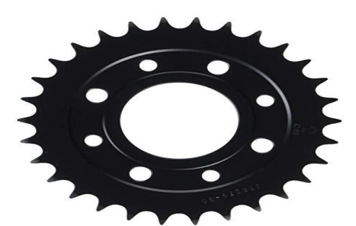
Figure 5: Sprockets.

The sprocket wheel engages a chain and runs over it, while a sprocket is a profiled wheel with teeth, cogs, or even sprockets. In contrast to gears that mesh directly, sprockets have teeth and pulleys are smooth; they are also used for power transmission from one shaft to another where slippage is prohibited. Instead of belts or ropes, sprocket chains are used and sprocket wheels take the place of pulleys. Some chains can run at high speeds and are constructed to be noiseless even while running at high speeds.