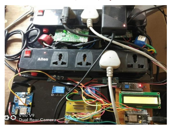
Figure 4.2: Experimental setup

The fig 4.3 showcase the energy consumed by distribution and sub junction and compares the power consumed by each junction.