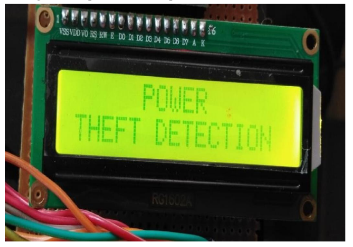
Figure 4.4: Power theft detection message display(LCD)

If there is any type of theft is happened on the distribution lines, immediately a message sent to the electricity office. Fig 4.4 shows the theft detected message with experimental set up.