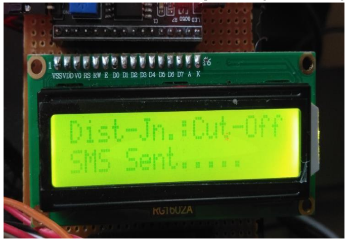
Figure 4.5: Automatic power cut-off message display

When the energy consumption is more than the threshold value the power will get cut-off using relay.