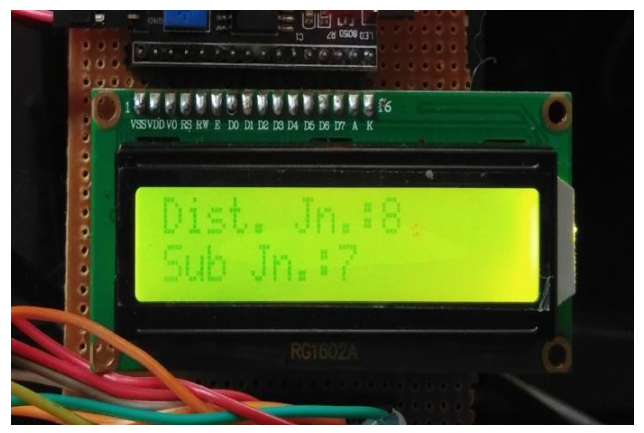
Figure 4.3: Distribution and sub junction difference unit display

The fig 4.3 showcase the energy consumed by distribution and sub junction and compares the power consumed by each junction.