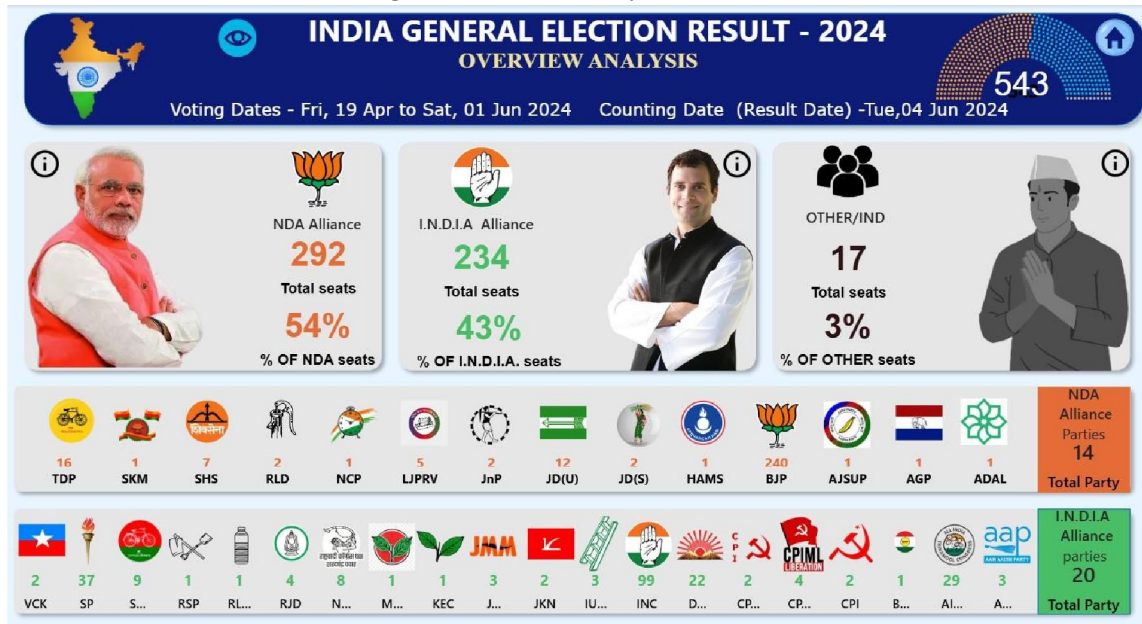
Figure 1: Overview Analysis Dashboard