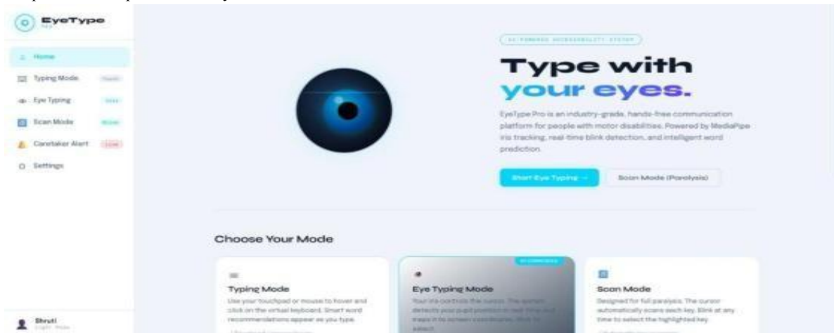
Fig. 2. User Interface of Communication Application

The proposed communication system was implemented using open-source technologies and low-cost hardware components. The frontend interface was designed to provide an accessible and user-friendly environment for individuals with speech and motor disabilities. Large buttons, simplified controls, and highcontrast themes were incorporated to improve usability and interaction.