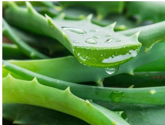
Fig: 4 Aloe vera

Aloe vera helps soothe and repair damaged skin.