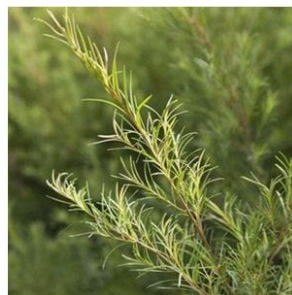
Fig:3 Tea tree oil

Tea Tree oil is effective against bacterial and fungal infections.