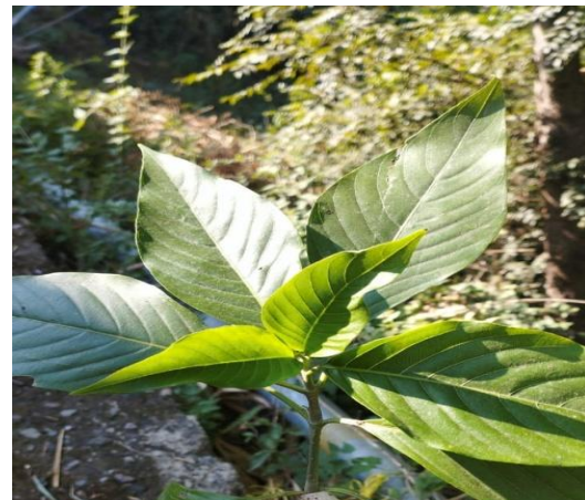
Figure 1: Justicia adhatoda