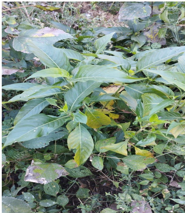
Figure 2 : Justicia adhatoda