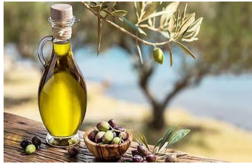
Fig.No. 8 : OLIVE OIL