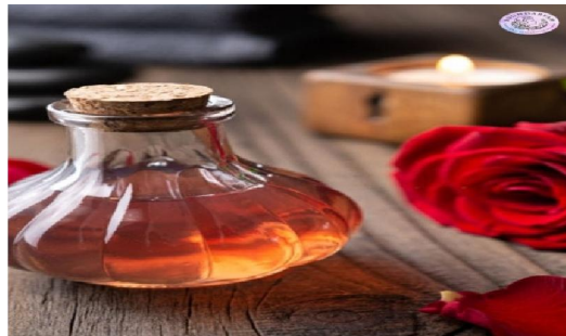
Fig.No. 9 : ROSE WATER