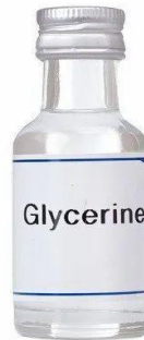
Fig.No. 10 : GLYCERIN

Synonym:- Glycerol, 1.2.3-Propanetriol, Glycerin.