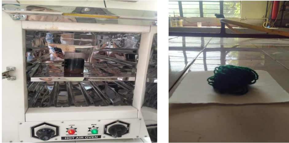
Fig. No. 14 : CLEANING TEST

5. FOAMING INDEX :- The formulation of herbal hair conditioner passes Foaming Index having result within the prescribed limit.