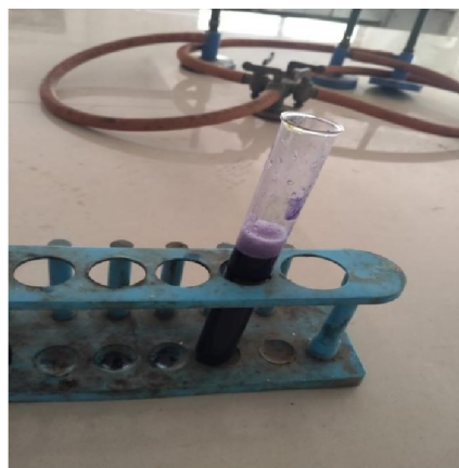
Fig. No. 13 : DIRT DISPERSION TEST

4. CLEANING TEST :-The formulation of herbal hair conditioner passes Cleaning Test having result within the prescribed limit