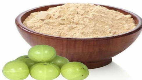
Fig.No. 4: AMLA