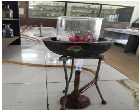
Fig. No. 11 : EXTRACTION OF HIBISCUS

PREPARATION METHOD OF HERBAL HAIR CONDITIONER :- Herbal hair conditioner was prepared by using given formula and preparation method