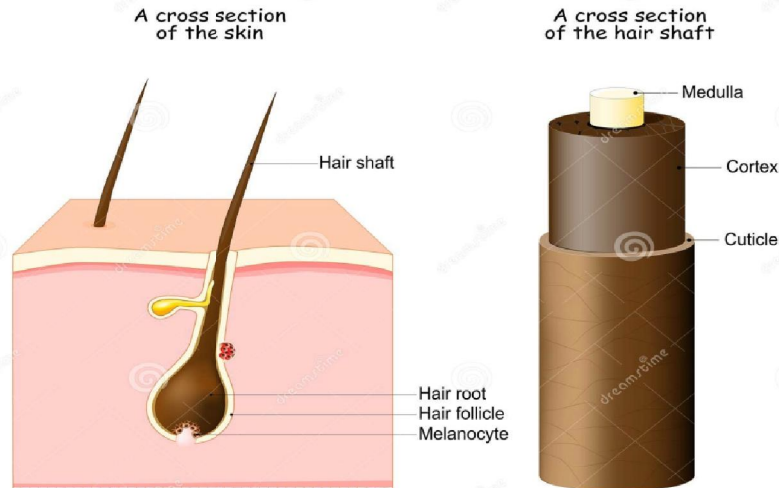
Fig.No.2 : ANATOMY OF HAIR

The hair shaft of mammals is divided into three main regions: