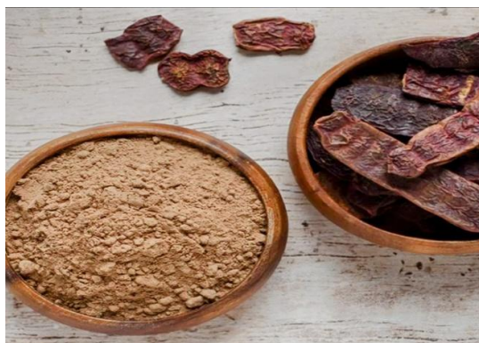
Fig.No. 5 : SHIKAKAI