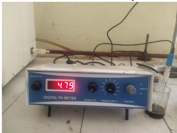
Fig. No. 12: pH TEST

3. DIRT DISPERSION TEST :-The formulation of herbal hair conditioner passes Dirt Dispersion Test by showing Light foam, which is within the prescribed limit.