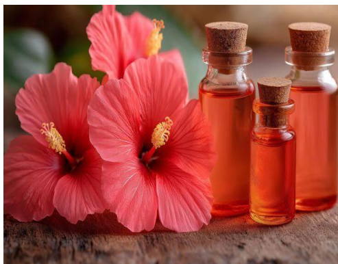
Fig.No 7 : HIBISCUS