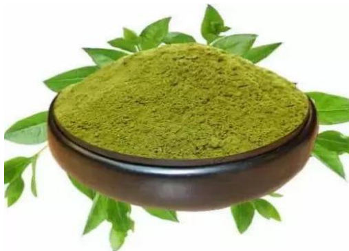
Fig.No. 6 : HENNA