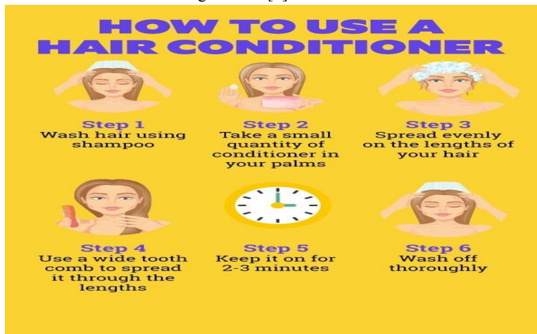
Fig.No. 1 : USE HAIR CONDITIONER