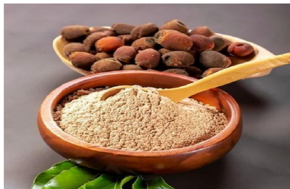
Fig.No 3: REETHA