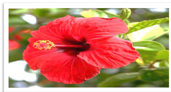
Fig 5 Hibiscus