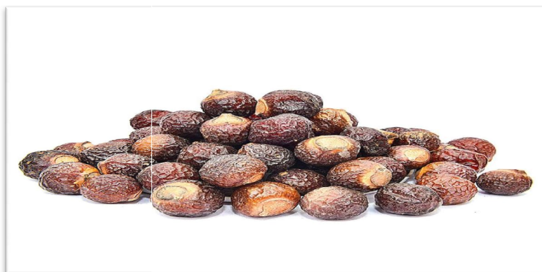
Fig. 8 Reetha