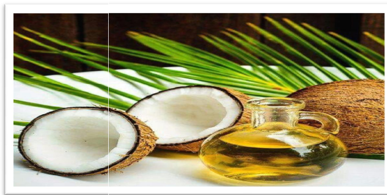
Fig. 7 Coconut Oil