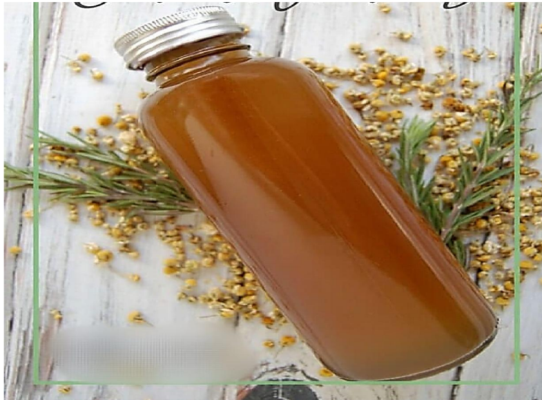
Fig. 1 Herbal Hair Shampoo