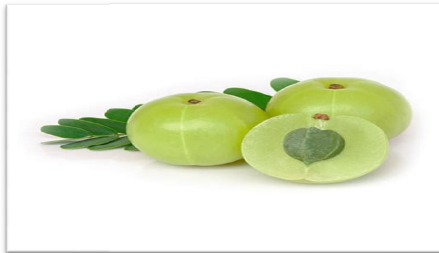
Fig. 4 Amla