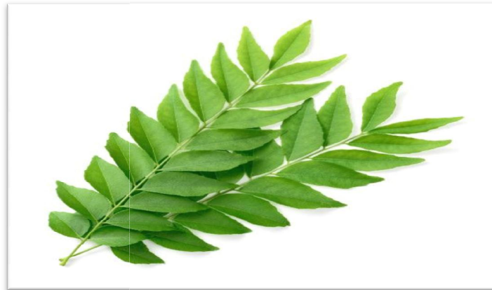
Fig. 6 Curry Leaves