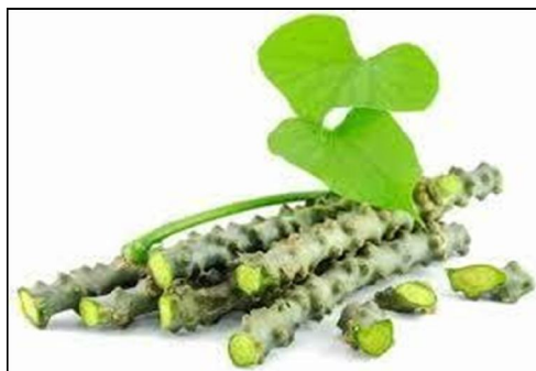
Fig.1 Gulvel plant

Biological Source: Gulvel is a widely distributed plant found in tropical regions of India, commonly growing in deciduous forests and over small trees and hedges. It is present up to an altitude of about 1200 meters, extending from Kumaon to Assam and across regions such as West Bengal, Bihar, Deccan, Konkan, Karnataka, and Kerala.