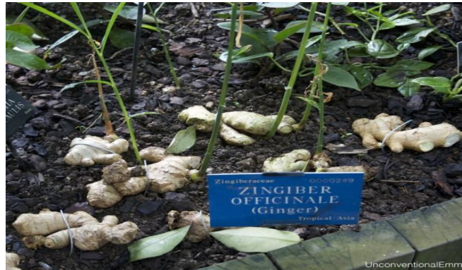
Fig.3 Zingiber officinale

It consists of the dried rhizomes (underground stems) of Zingiber officinale , collected after proper maturation and drying.