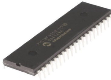
Fig. 2. PIC 18f4520