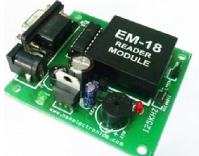
Fig. 4. RFID Reader

Active tags have their own battery source & offer a long range of access. Active tags are costlier than the passive ones.