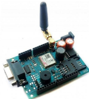
Fig. 6. GSM SIM 800

The Sim800C GPRS/GSM Shield with Antenna provides you with a way to use the GSM phone network to receive data from a remote location and it is compatible with all boards which have the same form factor (and pinout) as a standard Arduino Board. This shield can also be applied to DIY phones for calling, receiving and sending messages, making GPS trackers or other applications like Smart home, etc.