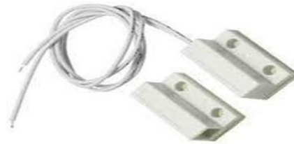
fig 7. Magnetic Switch