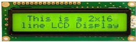
Fig 6. LCD with Driver