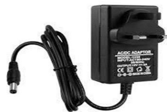
fig 5. Power Supply