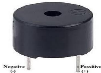
fig 4. Panic Button