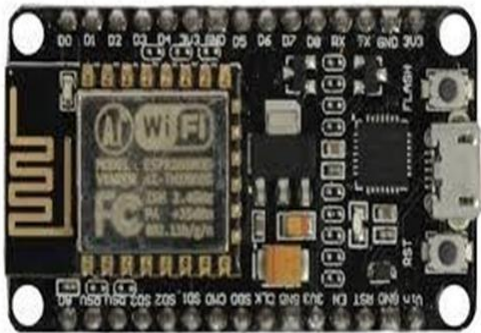
Fig 1. ESP8266 Microcontroller

Alert notification system for registered contacts.