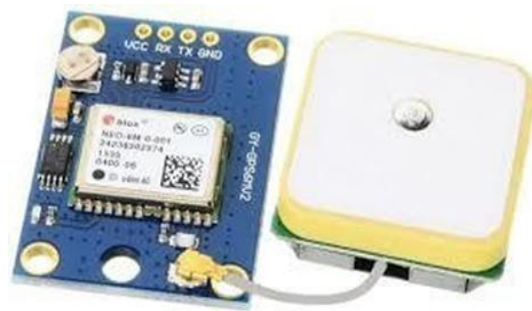
Fig 2. GPS Module