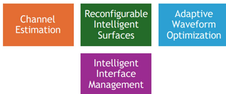
Fig. 2: Applications of AI for 6G Wireless Communications

Another breakthrough is the integration of reconfigurable intelligent surfaces (RIS) into 6G networks. RIS consists of programmable metasurfaces that can dynamically manipulate electromagnetic waves to optimize signal propagation. This technology enhances beamforming efficiency, reduces interference, and enables smart reflection of signals to bypass obstacles, ensuring consistent connectivity in urban and indoor environments. Signal processing algorithms in RIS utilize AI to dynamically adjust surface parameters, maximizing spectral efficiency while minimizing energy consumption.