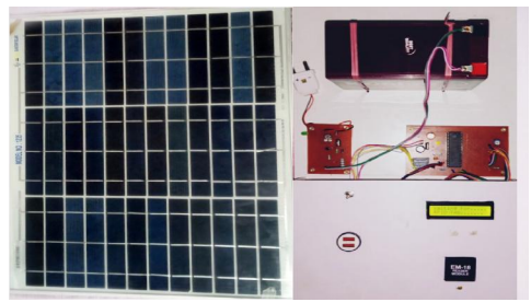
Figure: Project Hardware