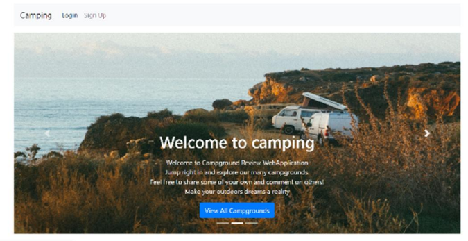
Figure 1: Front Page