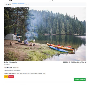
Figure 7: Details edited

This web-application is created using EJS, CSS and JS.