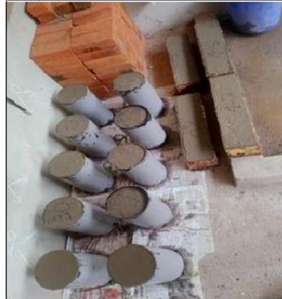
FIG 2. SPECIMEN CASTED

After demoulding, specimen is marked with a legible identification, on any of the faces. The concrete specimens are placed in a curing tank after demoulding for 28 days of curing period. For obtaining flexure behavior of RC beams, beam of size 100×200×1500mm were casted in wooden moulds to maintain the dimension of the beam in the laboratory. The bottom flexural reinforcement consisted of two numbers of 12mm diameter bars providing a total cross section of 226.19mm 2 and the top.