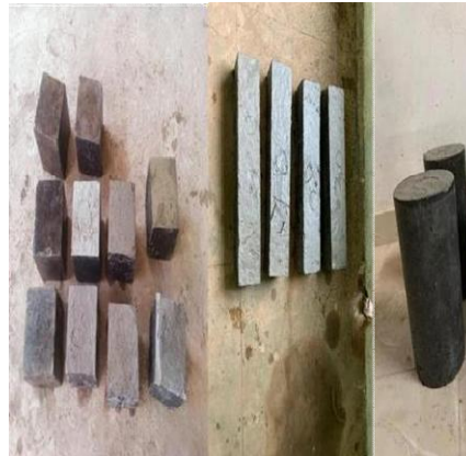
FIG 3 SPECIMEN AFTER 28 DAYS OF CURING